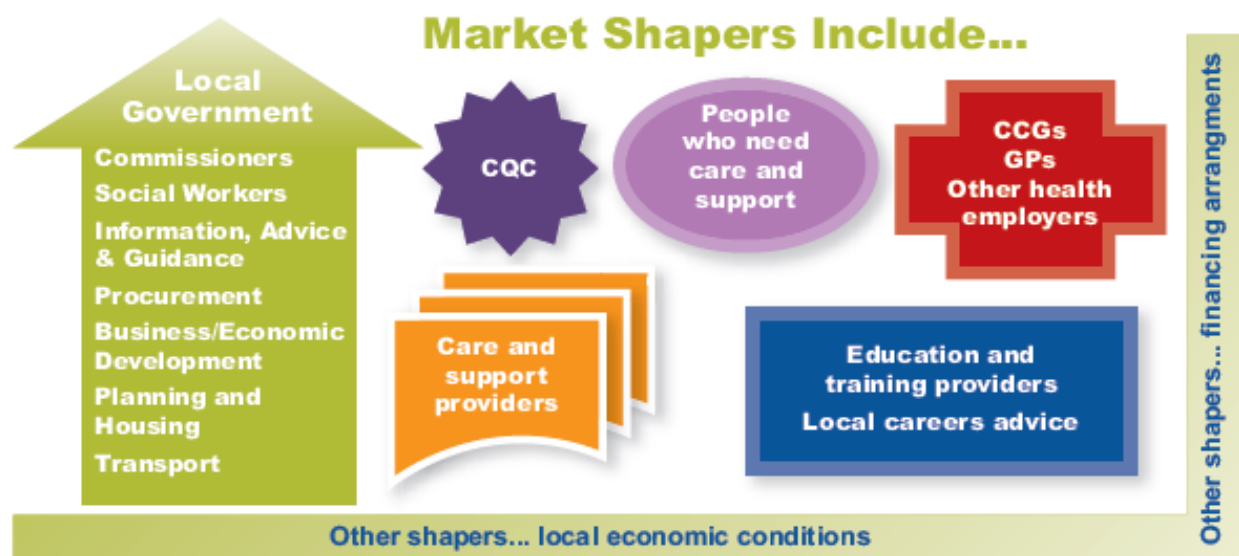
Figure 4: Market shapers

What is Market Shaping? (IPC, July 2016, p10)